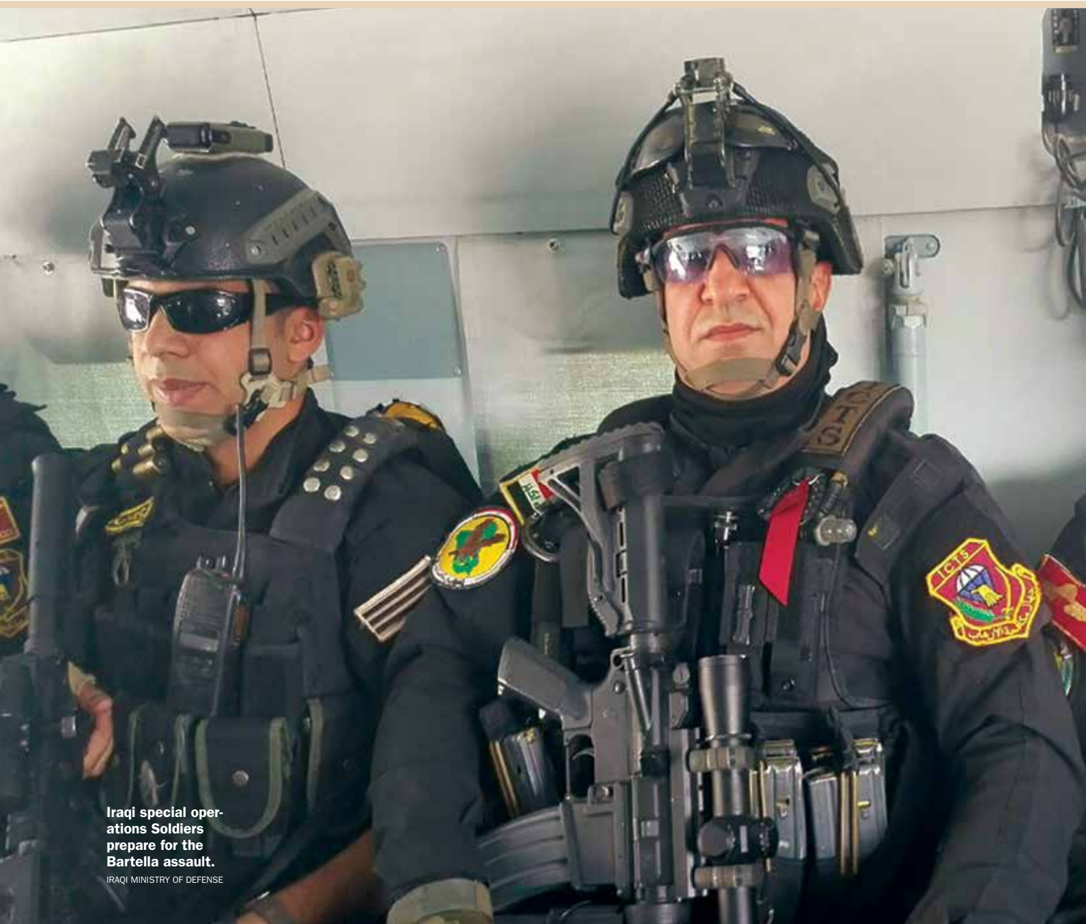
Iraqi special operations Soldiers prepare for the Bartella assault.