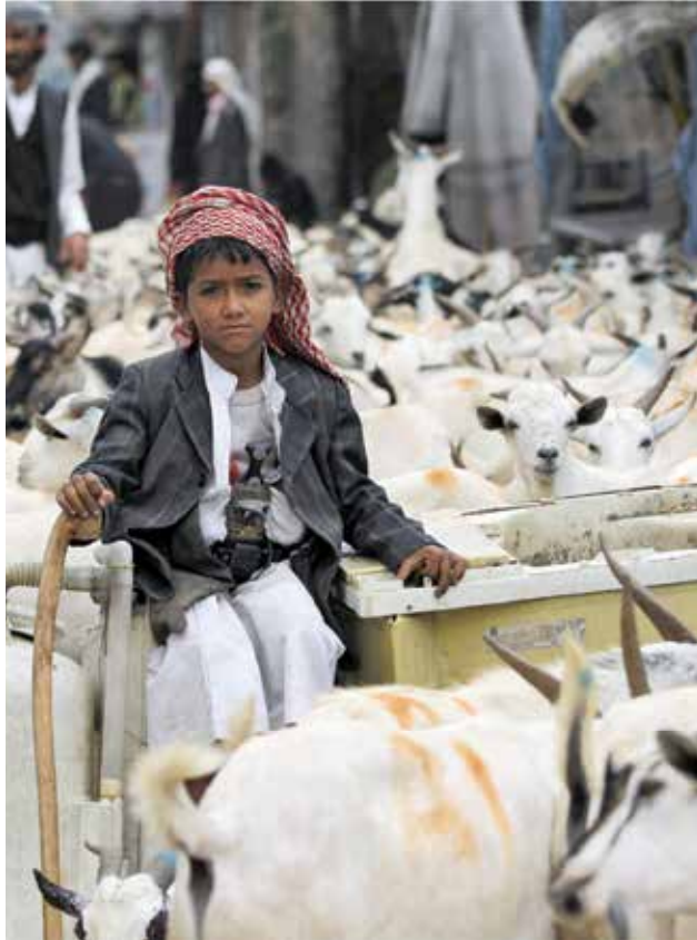
A Yemeni boy at a livestock market in Sanaa in September 2016