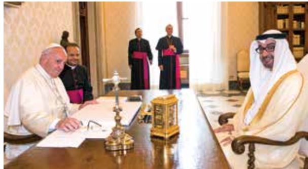
Pope Francis, left, and His Highness Sheikh Mohammed bin Zayed Al Nahyan meet in the Vatican in September 2016.

He wrote about the use of social media to glorify murder and destruction and to prey on the emotions of young people. "We must use every tool available to us to defeat their nihilist ideology of hatred," he wrote. "In this endeavor, the UAE has acted in collaboration with friends who share our values."