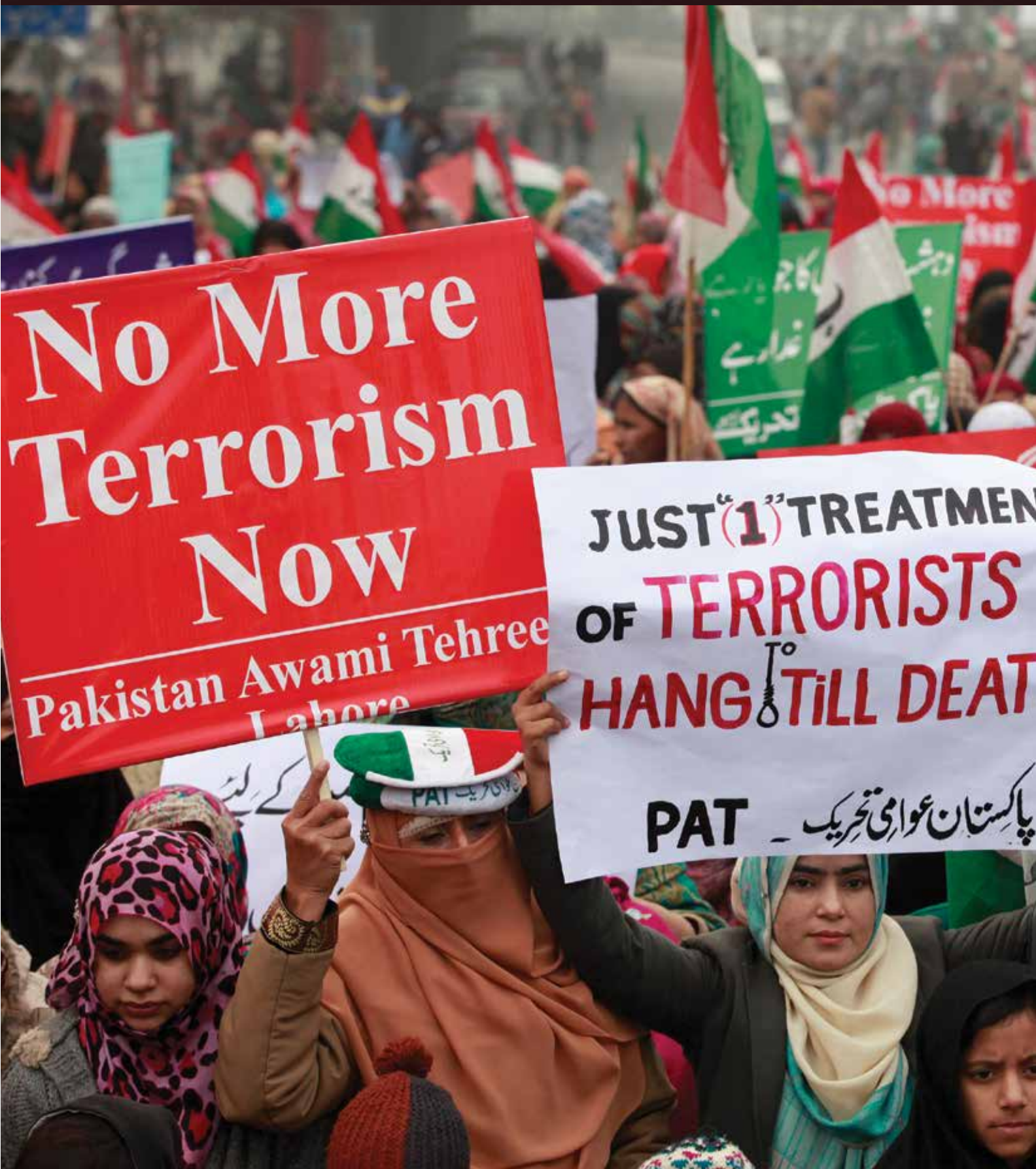
Supporters of the political party Pakistan Awami Tehreek rally to condemn the attack by Taliban gunmen at the Army Public School in Peshawar in December 2014.