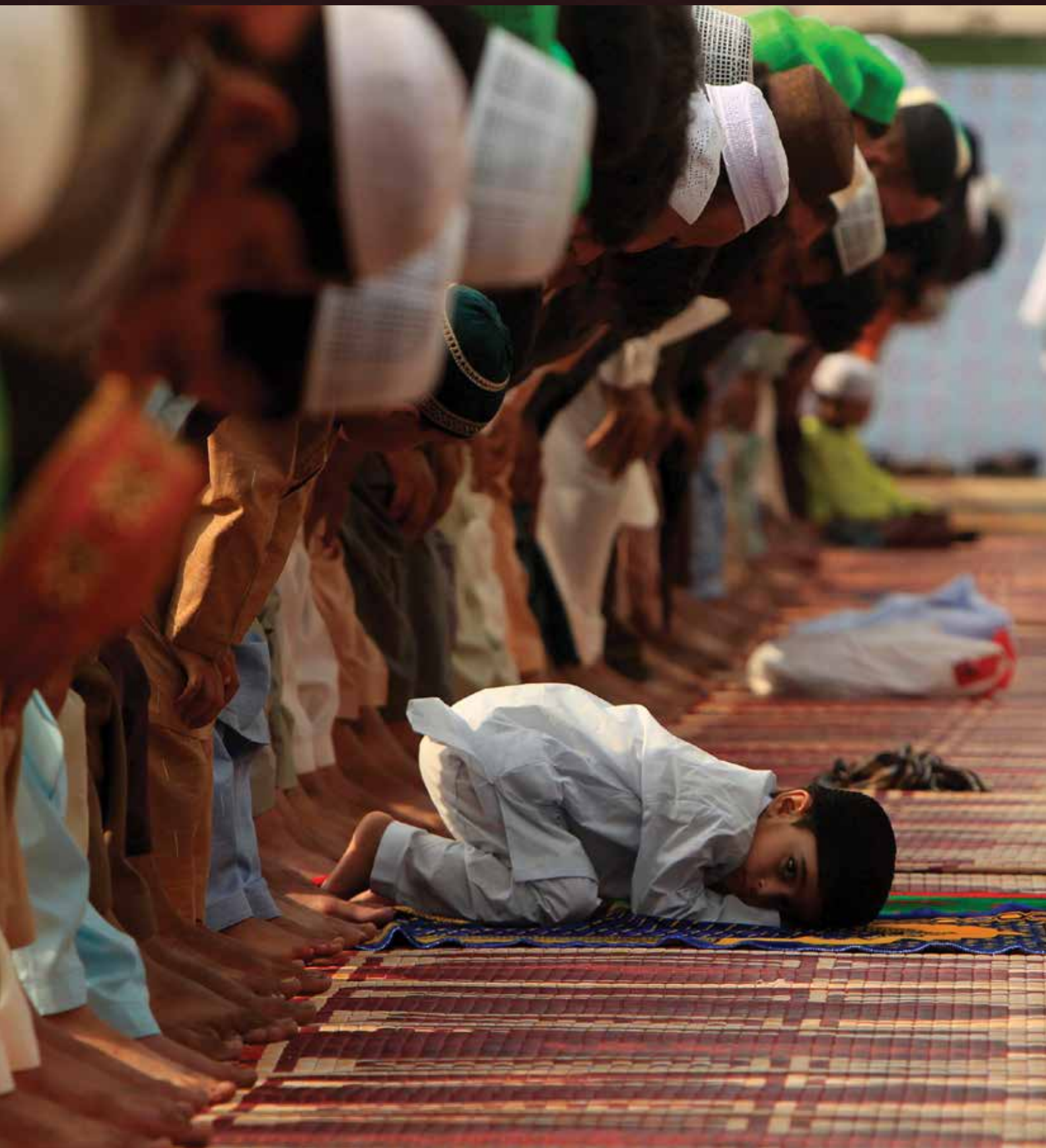
A boy attends Eid al-Fitr prayers at the Jamia Masjid in Rawalpindi, Pakistan. Terrorists' false religious narratives must be countered within a religious domain.