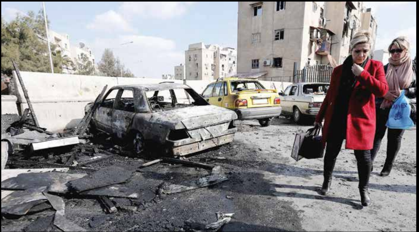
Governments must counter the online messaging that leads susceptible recruits to carry out bombings such as this one in Damascus, Syria, in April 2016.

lose valuable time reacquiring followers, and may ultimately push some to use social media channels that are far less public and accessible than Twitter.”