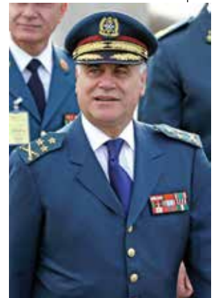
Lebanese Army Commander Gen. Jean Kahwagi

Sources: Reuters, Lebanese Ministry of Information