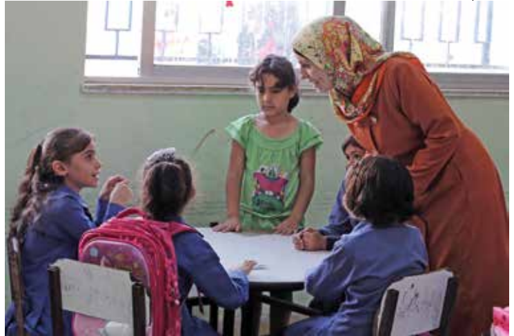
A Jordanian teacher talks to Syrian refugee students at a school in Amman, Jordan.

In Syria alone, an estimated 2.1 million children are not enrolled in school. Failing to provide an education