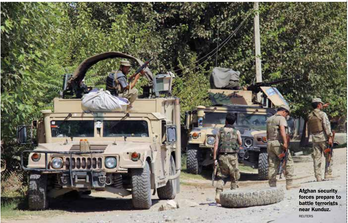
Afghan security forces prepare to battle terrorists near Kunduz.