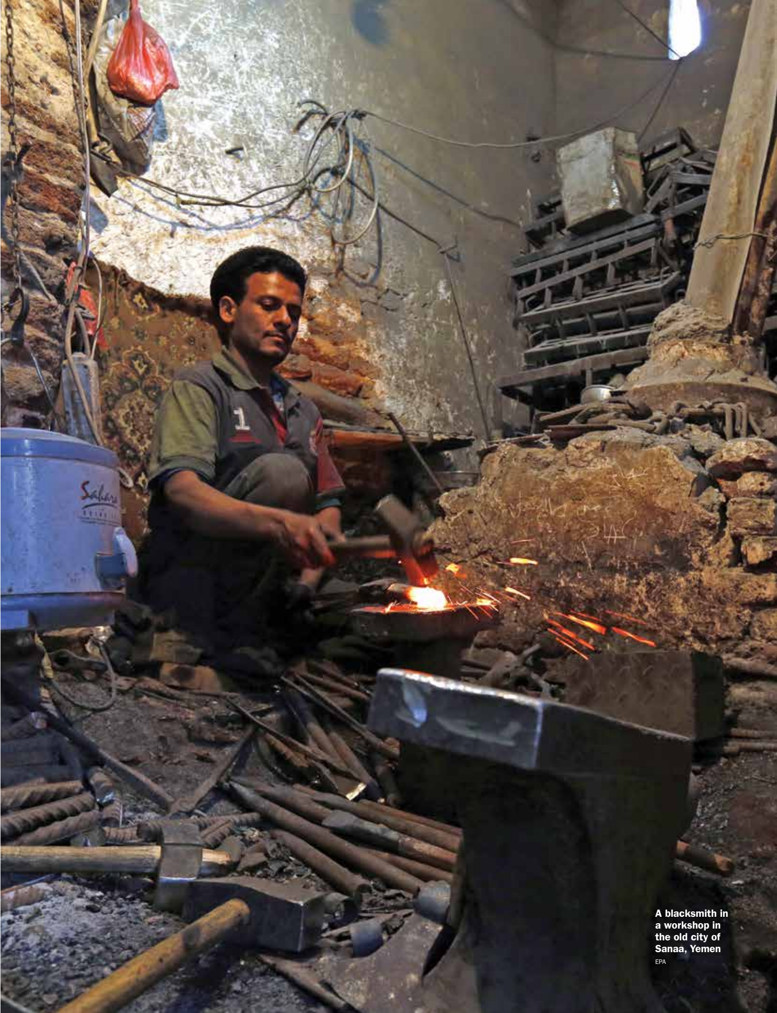
A blacksmith in a workshop in the old city of Sanaa, Yemen