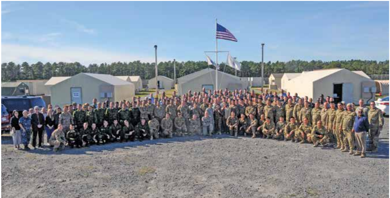
Participants from Kazakhstan, the Kyrgyz Republic, Mongolia, Pakistan, Tajikistan and the U.S. took part in U.S. Central Command's 2016 Regional Cooperation multinational exercise.