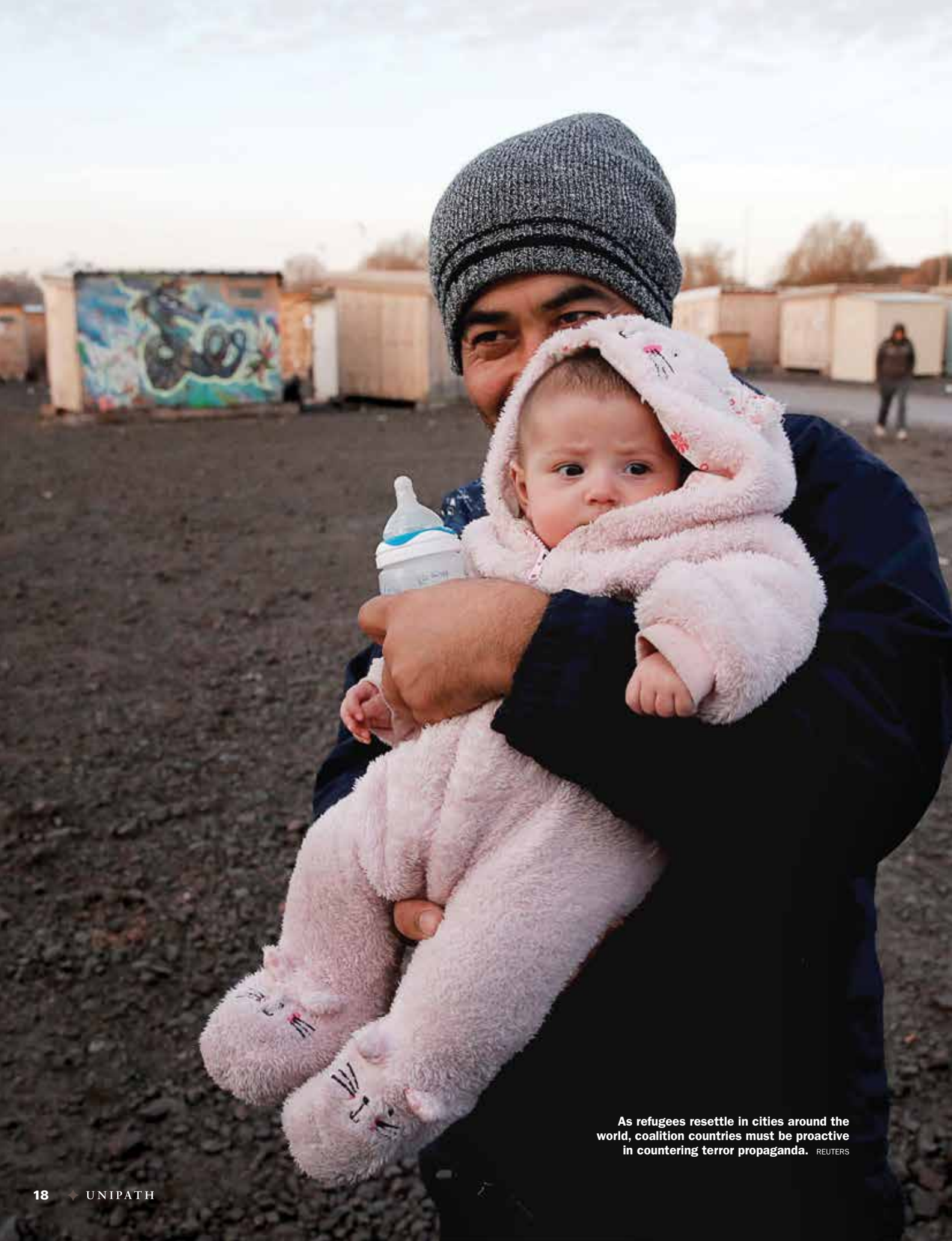
As refugees resettle in cities around the world, coalition countries must be proactive in countering terror propaganda.