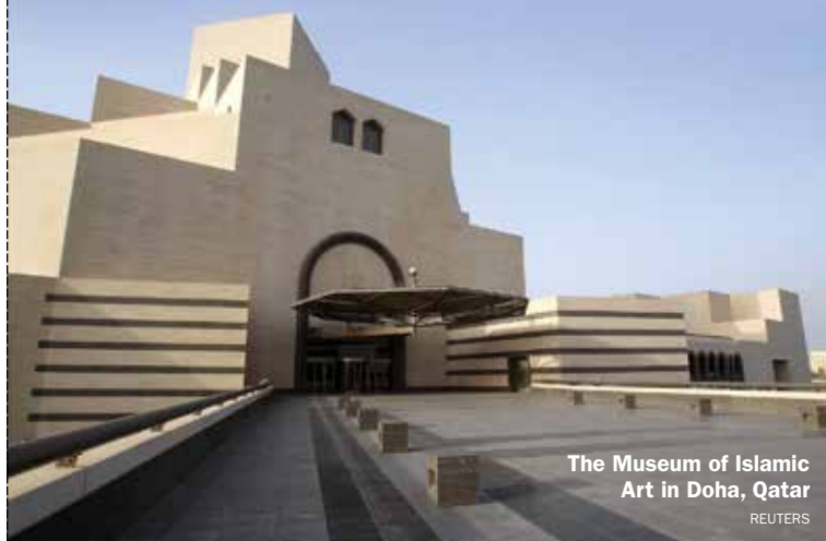
The Museum of Islamic Art in Doha, Qatar

The partnership reflects Qatar's commitment to support efforts to build peace and solidarity among nations. Sources: The Peninsula , UNESCO Office in Doha