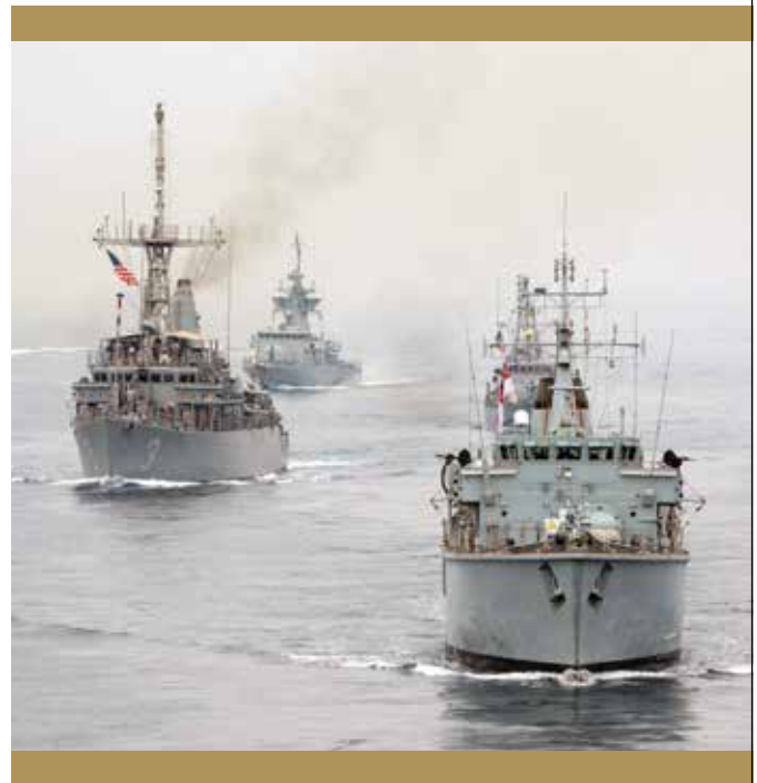
Multinational maritime forces travel in formation at the International Mine Countermeasures Exercise in the Arabian Gulf in April 2016. Naval coordination is the subject of a new course at the U.S. Naval War College.

The course is designed for naval lieutenants, lieutenant commanders and commanders. Some exceptions may be made, and other ranks may attend on a case-by-case basis.