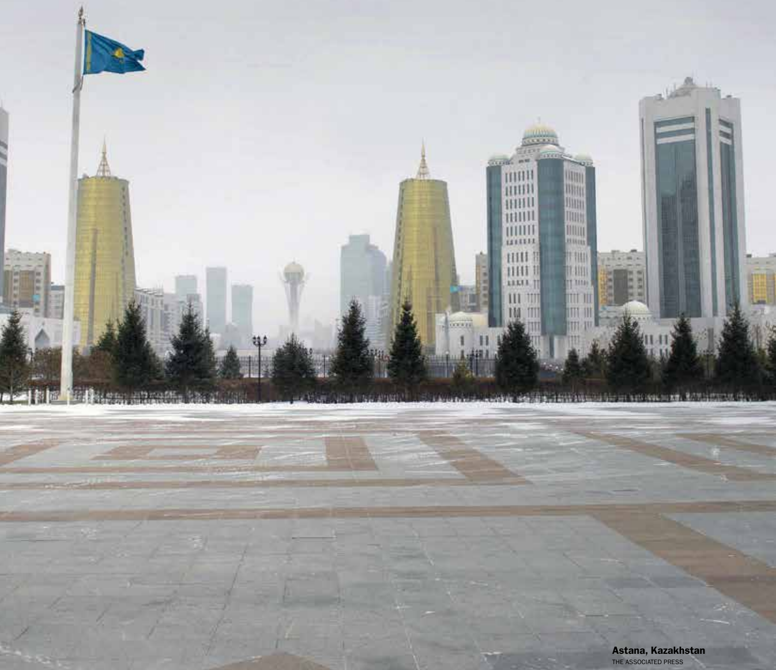
Astana, Kazakhstan

Kazakhstan is a leader in providing electronic public services. Of the 675 government services, 236 are e-government accessible through e-gov.kz, and 77 are available online.